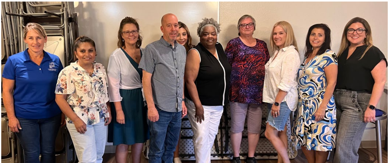
Agency Partner Council Quarterly Meeting 6.24.24 (L to R: Lighthouse Charities, Junior League, St. Elizabeth Ann Seton, St. Paul Charismatic, United Labor Agency Decatur, M.O.S.E.S, Pahrump New Hope Fellowship, Project Marilyn, Jewish Family Services Agency, Baby's Bounty)

89166 | 89149 | 89129 | 89134 | 89138 | 89144 | 89128 | 89145 | 89108 | 89107